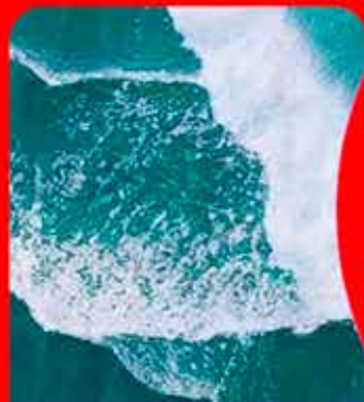
Sea Symphony Stag Theatre Saturday 28 June