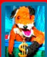
GOLDIFOX Sat 21 June