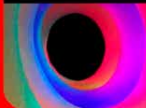
On The Vine Sat 28 June Specsavers