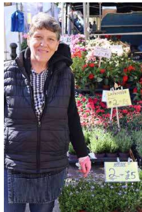
Sevenoaks Town Council wants to safeguard the historic market rights

There is a list of additional assets which are owned by Sevenoaks District Council and would transfer to the new Unitary Authority if and when established.