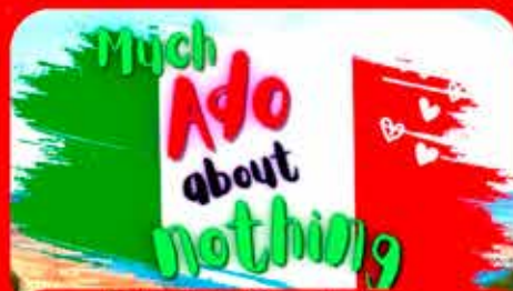
White Rock Inn Open Air Shakespeare