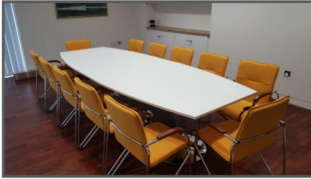
The Meeting Room has a window aspect