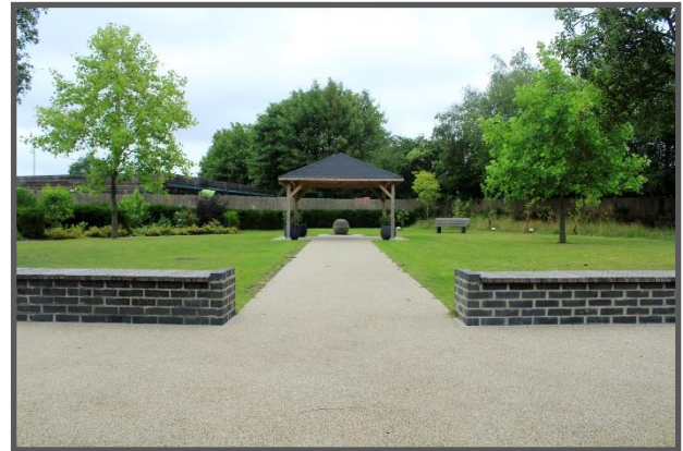
The Garden Area with Gazebo